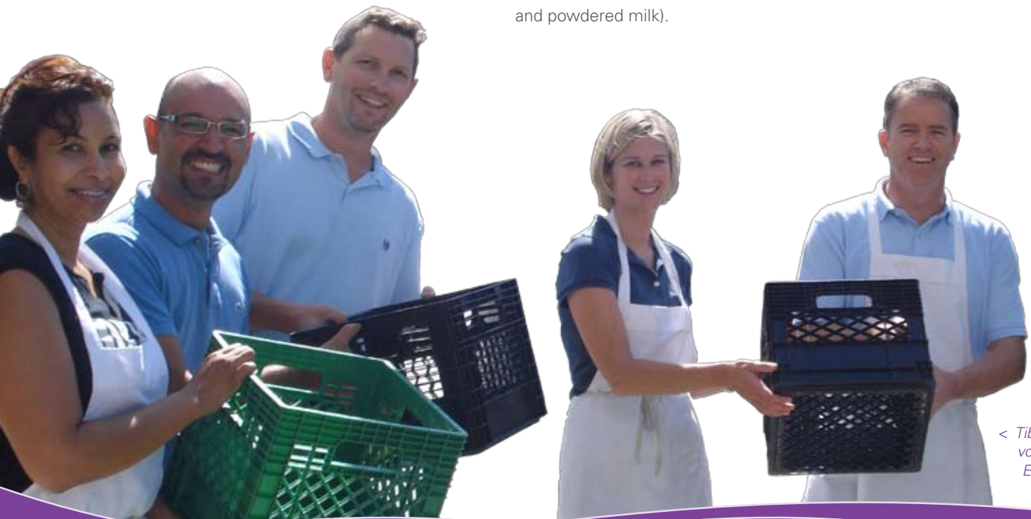
< Tibotec employees volunteering in the Essentials Market