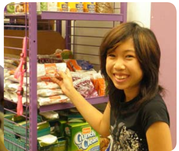
< Essentials Market volunteers working hard