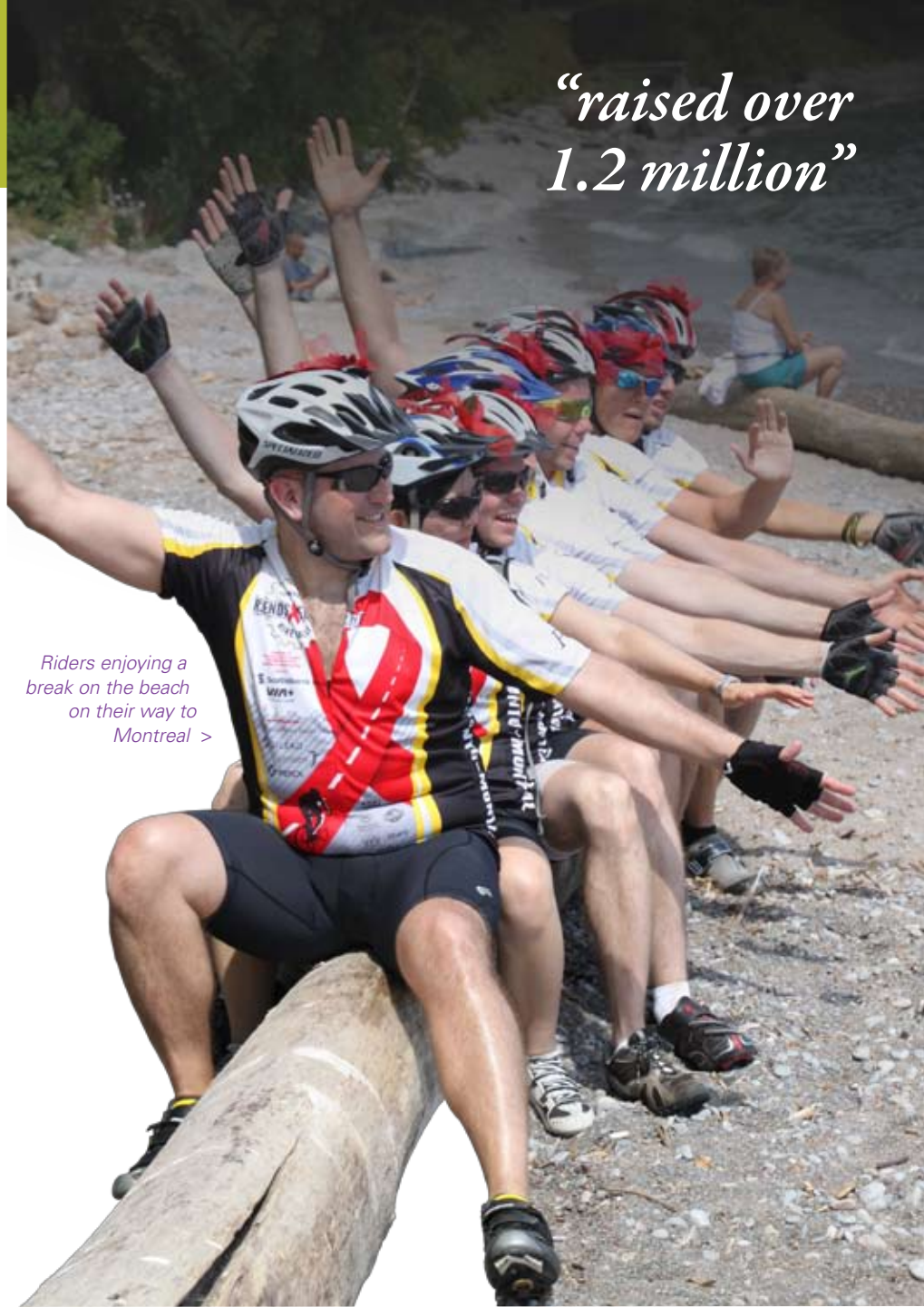
Riders enjoying a break on the beach on their way to Montreal >

Community Supporters — Cycle Solutions, Emergen-C, Henderson House, KiKi maple sweet water, Liberte, Mini Downtown, Muscle Masala, Print City, Raymond Helkio Advertising and Design, Stonemill Bakehouse