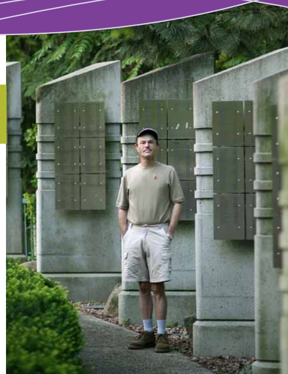
AIDS memorial at Cawtha park

Your support always helps but it couldn't have come at a better time. This year we've seen a 20% increase in need for our Essentials Market (food bank) and expect to see an even more increased need over the holiday season. The winter holiday season can be a particularly difficult time of year for some of PWA's clients. Poverty excludes people from what are normally festive holiday celebrations, entertaining, visiting with friends, gift giving and receiving.