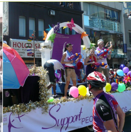
PWA's staff on our float in the Pride parade cooling off the crowd with water pistols