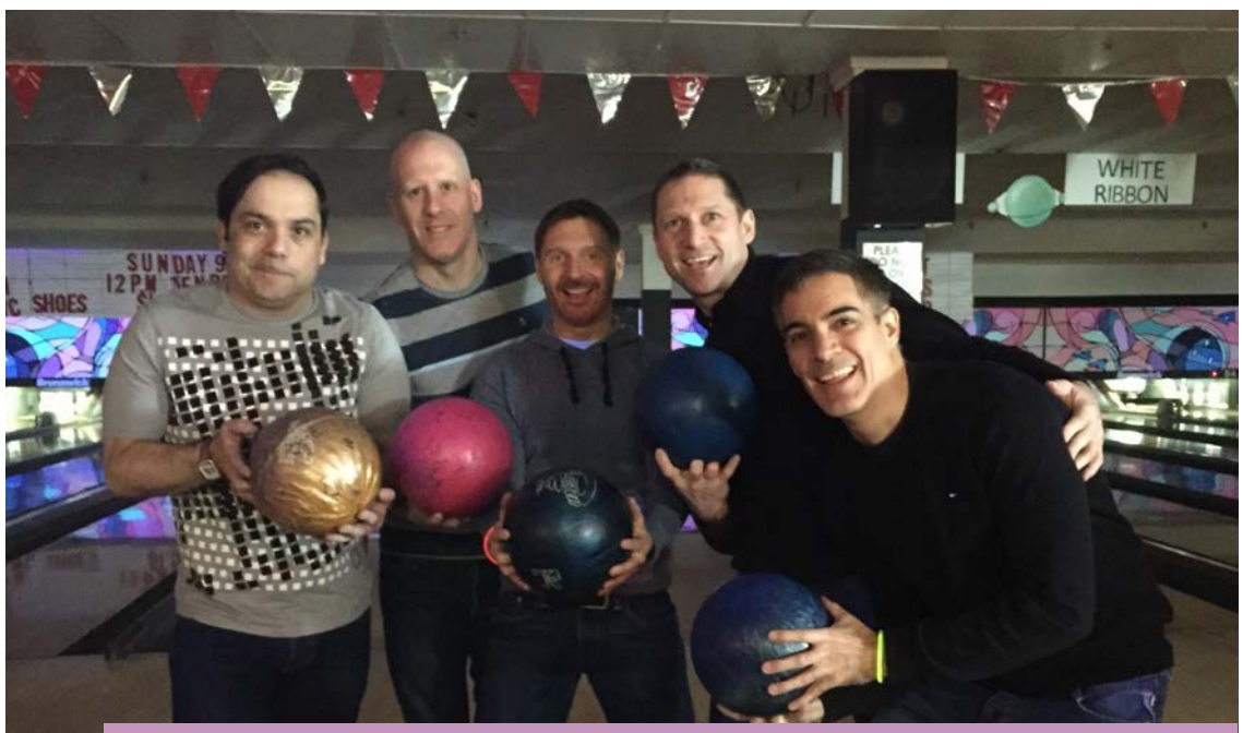
Top Fundraising Team—The Water Bowlers choose the perfect balls for their potential strikes!

PWA to benefit from Pride and Remembrance